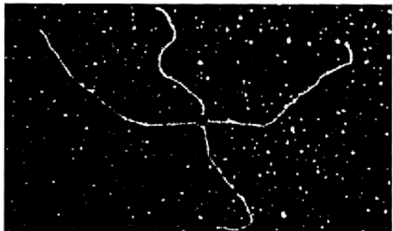
CROSSOVER is the fundamental mechanism of genetic re-arrangement for both real organisms and genetic algorithms.